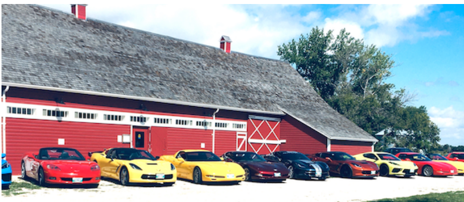
The Corvette Club of Manitoba came for a visit to Altona and Neuberghthal on August 22 The Manitoba Classic & Antique Auto Club came out earlier in the summer.

Throughout the summer I was exposed to local history which I would not have learned otherwise. I would frequently go to my parent’s house with a new “Did you know” story. I am so thankful for the opportunity to meet so many new people and hear so many new stories.